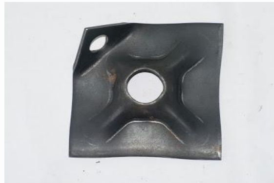
Dog Eared Dome wall