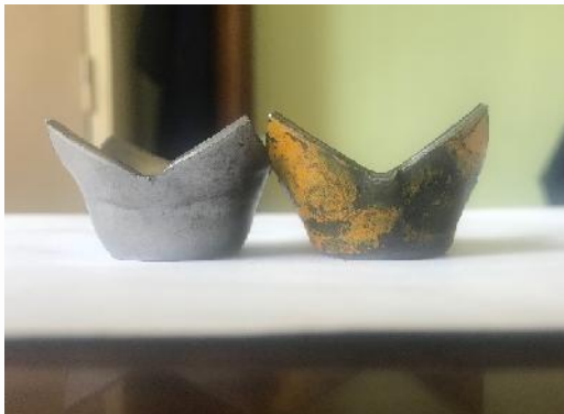
Load Indicator Washers