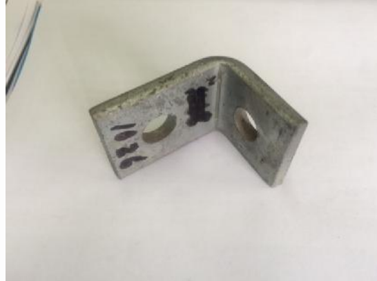
V Shape Bracket