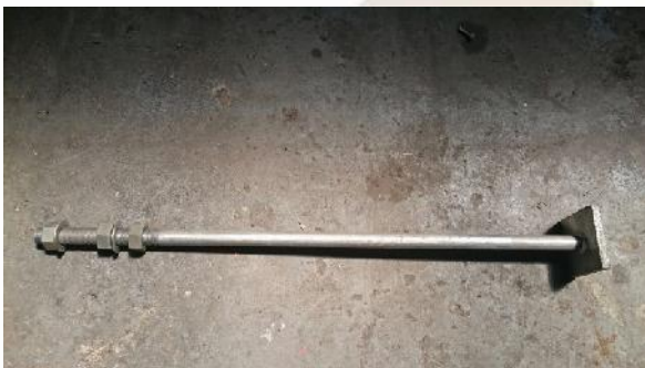
Foundation Bolt Bennox Through Hardened