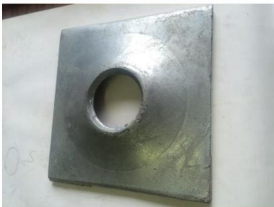
Square Indent Washer