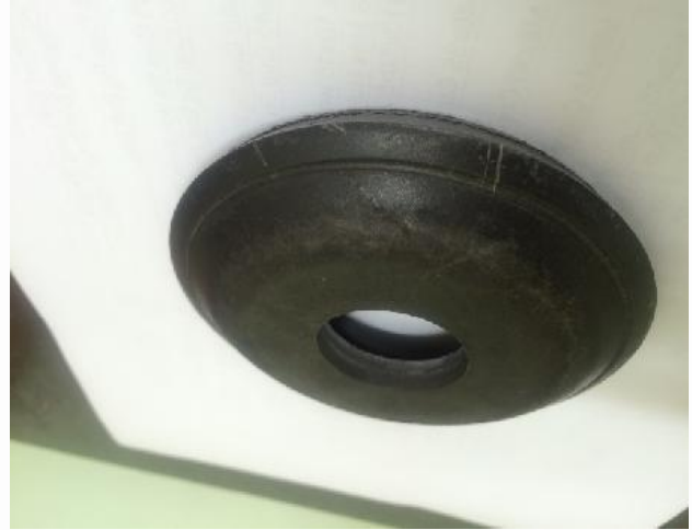
Round Cup Washer