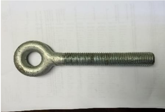
Threaded Eyeball Bar

Business Address: 14 Theodore Street Delville, Germiston, 1401