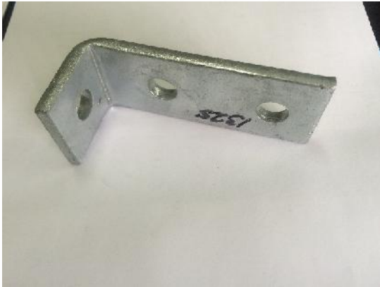
Galvinised L Bracket