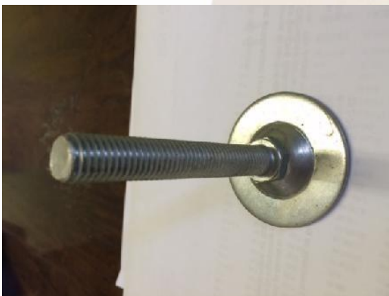
Base Threaded bar