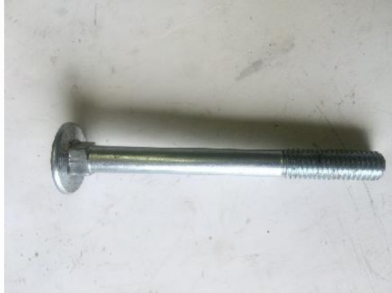
Cup Square Bolt