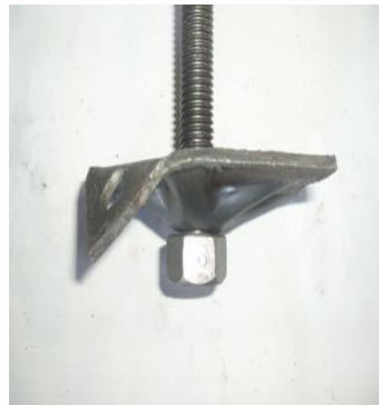
Mining Roof Bolt