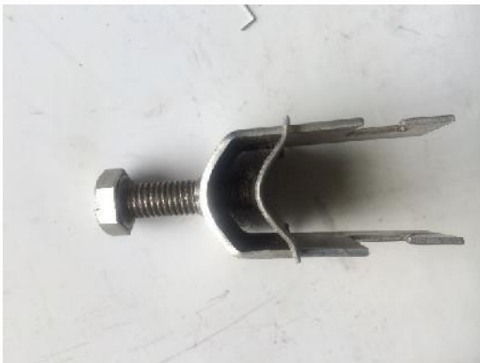
Cable Clamp Bracket