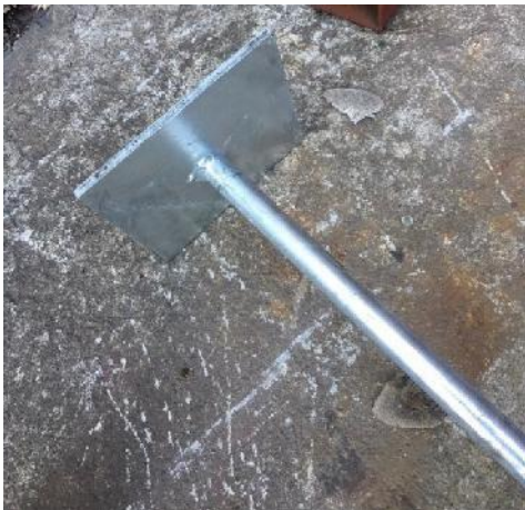
Fixed Stay Rod