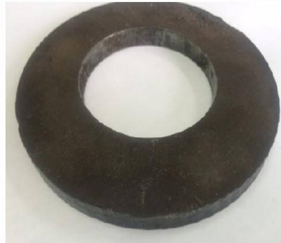
Hardened Steel Washer