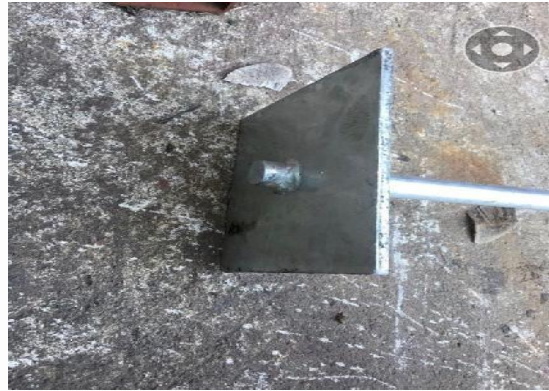
Fixed Stay Rod