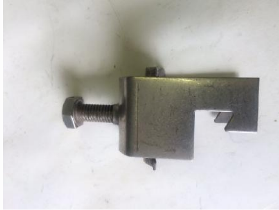
Cable Clamp Bracket