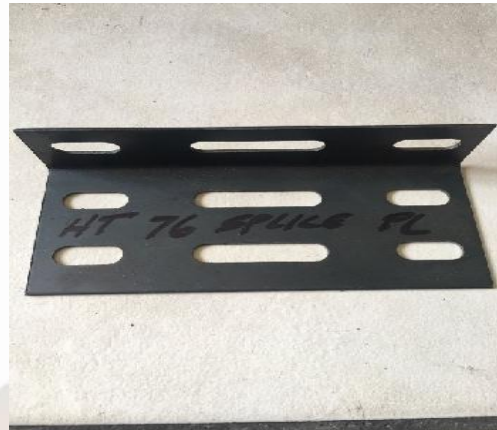
HT 76 Splice PL