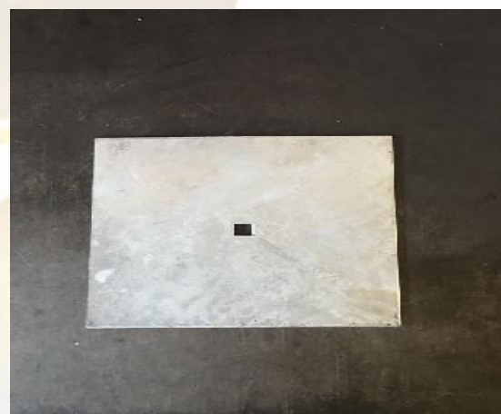
300 x 300 Base Plate