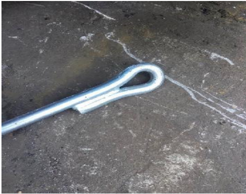
Fixed Stay Rod